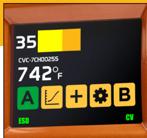
Tip temperature displayed on large color screen.